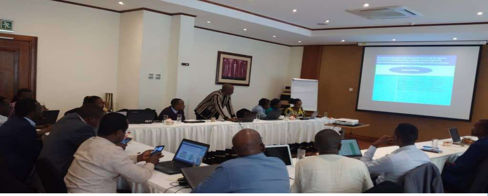
Photo: Stakeholders from various governement institutions, NGOs, Private sectors during the workshop

Meeting of National Coordination Team for National engagment with the GCF on 1 September 2022