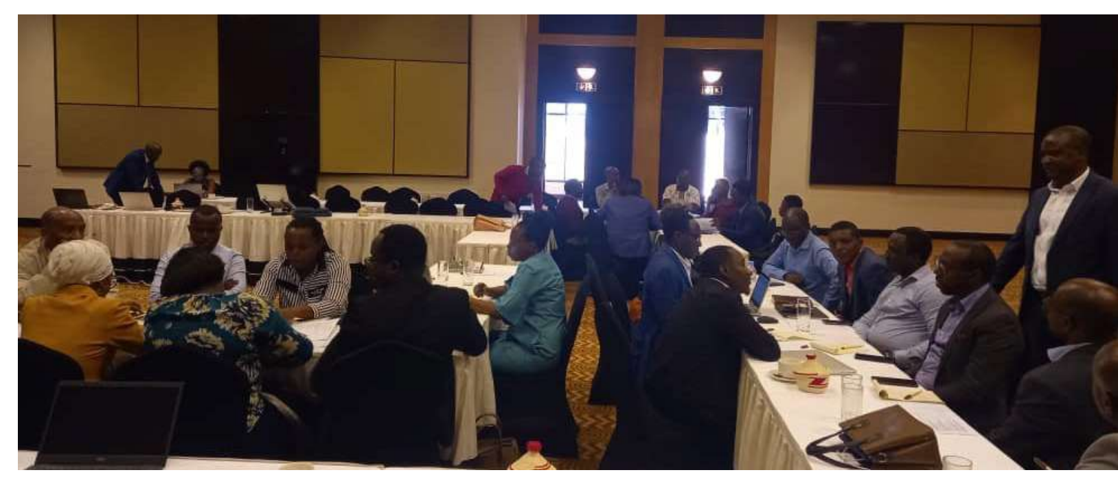
Photo: The participants in group discussion during inception workshop

The unique expertise of the private sector, its capacity to innovate and produce new technologies for adaptation, and its financial leverage can form an important part of the multi-sectoral partnership that is required between governmental, private and non-governmental actors.