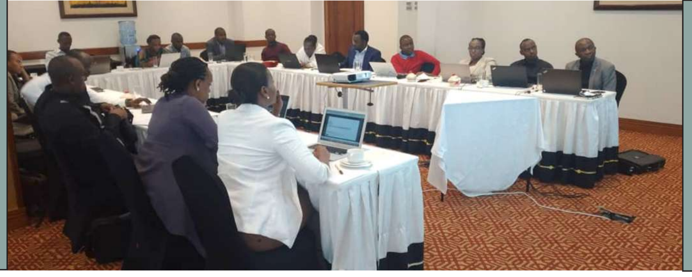
Photo: Stakeholders during discussion in plenary session of the workshop

Meeting of National Coordination Team for National engagment with the GCF on 2 August 2022