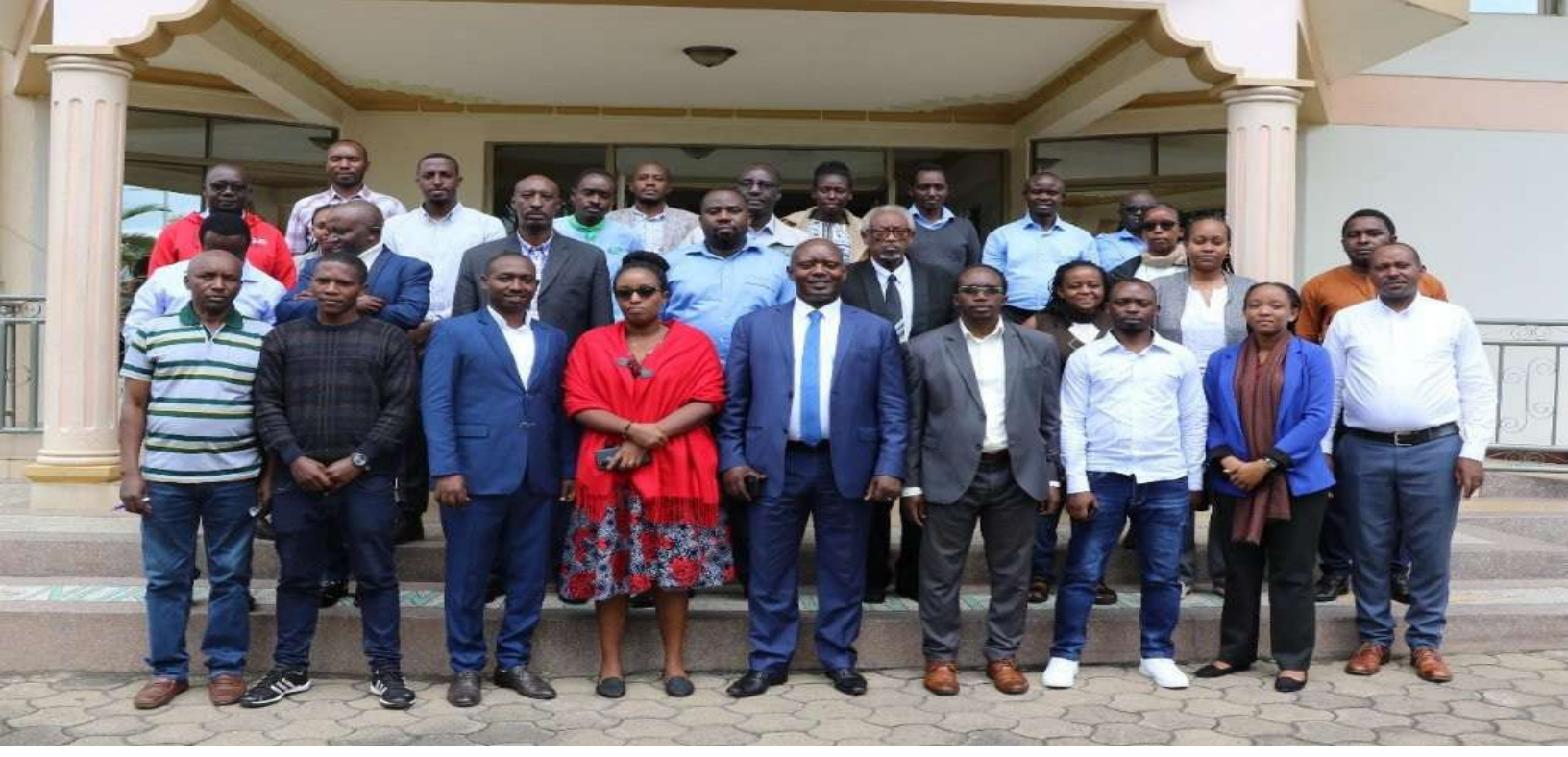
Photo: Stakeholders at the validation workshop of country programme and readiness needs assessment Foreword