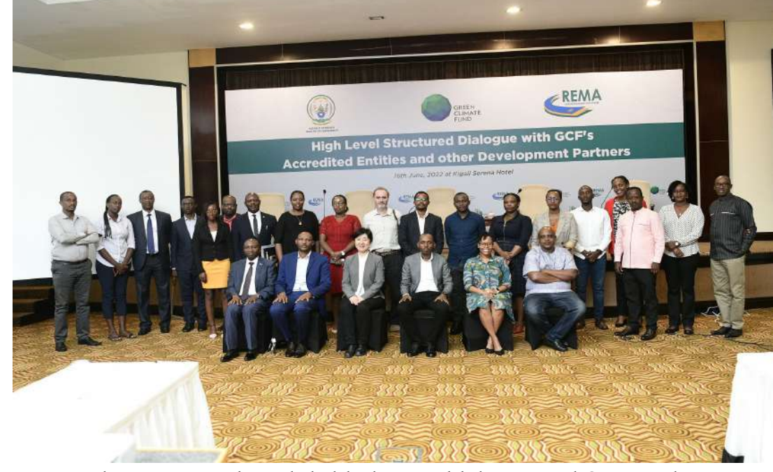
Photo: Participants during the high level structured dialogue at Kigali Serena Hotel

12h30 - 01h00: Way Forward and Closing remarks