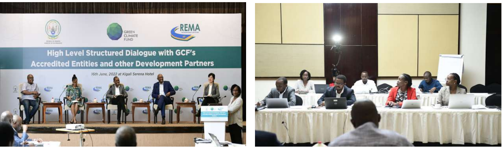
Photo: Discussion in plenary session of the workshop and panel session

Other discussion were convened through the panel session, where the panelists were the representatives from International Union for Conservation of Nature (IUCN), Rwanda Environment Management Authority (REMA), Private Sector Federation (PSF), and the Ministry of Environment (MoE).