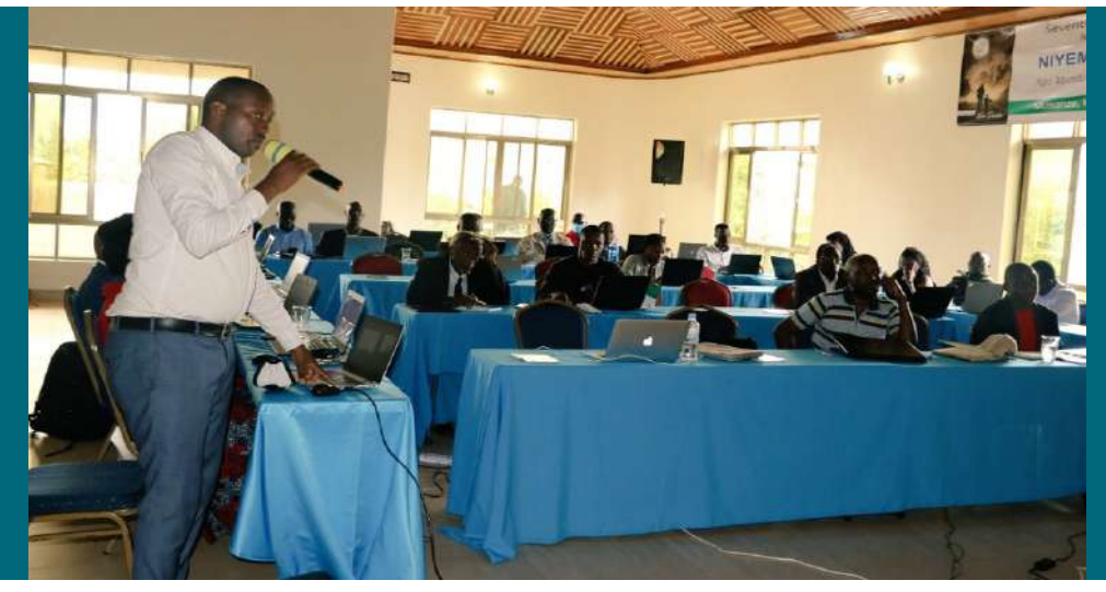
Photo: Stakeholders at the validation workshop of country programme and readiness needs assessment following the presentation session

R EMA as the National Designated Authority conducted a training workshop for government institutions and non-governmental stakeholders on GCF project formulation and approval process. The training covered the key topic areas to consider during a GCF project formulation and approval process which are;